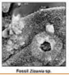
Fossil Zizania sp.