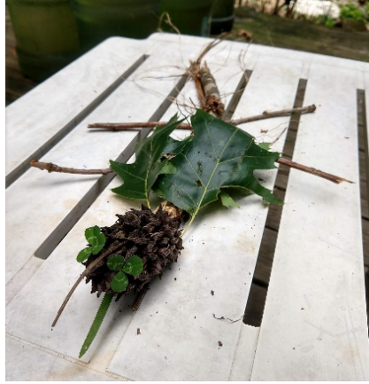
BJ's Creature "Woody Crawler"