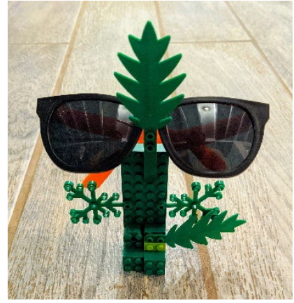
Nate's Creature "dfhfhhd"

Scientists take notes about the creatures they find. Write your own notes about your creature.