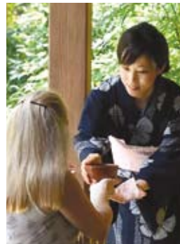
Clockwise from top left: Duke Law students volunteer in the nursery; visitors enjoy a walking tour; volunteer docent training; a Japanese Tea Gathering.

We also began planning for a grand celebration of the Volunteer Program's 25th anniversary in 2016—we look forward to toasting the volunteers' many important contributions to the Gardens' growth.