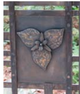
Clockwise from top left: Silky camellia ( Stewartia malacodendron ); azure blue sage ( Salvia azurea ); the McNabb Family Stream; student admiring the Jerusalem artichoke ( Helianthus tuberosus ); and one of the metalwork panels on the McNabb Family Bridge. All photos from the Blomquist Garden of Native Plants.

The McNabb Family Bridge and Stream, a 270-foot-long recirculating stream and 30-foot-long footbridge, were completed in spring. This new feature just to the left of the garden's main entry is irresistible to visitors, who can't help but be