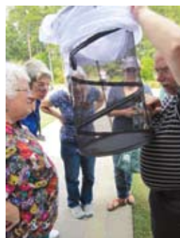
Clockwise from top left: Duke students enjoy Duke VisArts’ “Paintout” in the Culberson Asiatic Arboretum; visitors enjoy a walking tour; the “Art and Nature” exhibit; learning about butterflies.

Among the Durham community partners we collaborated with are the Durham Forestry Department, N.C. Urban Forestry Council, Farm to Fork, the N.C. Native Plant Society, Durham Extension Gardeners, Durham Garden Forum, the Durham Beekeepers Club, the Durham Photography Club and the Triangle Orchid Society. Each year brings new partners and new ideas about how to strengthen the critical relationship between people and plants.