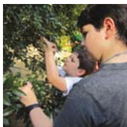
Above: Children learn about nature in the Gardens’ Children & Family Programs.

Nature Adventures Camp and our other discovery programs for children continue to draw a strong following of youngsters curious about how the Earth’s plants and creatures live and grow. Our camp educators help children make critical connections between themselves and the world outside their doors.