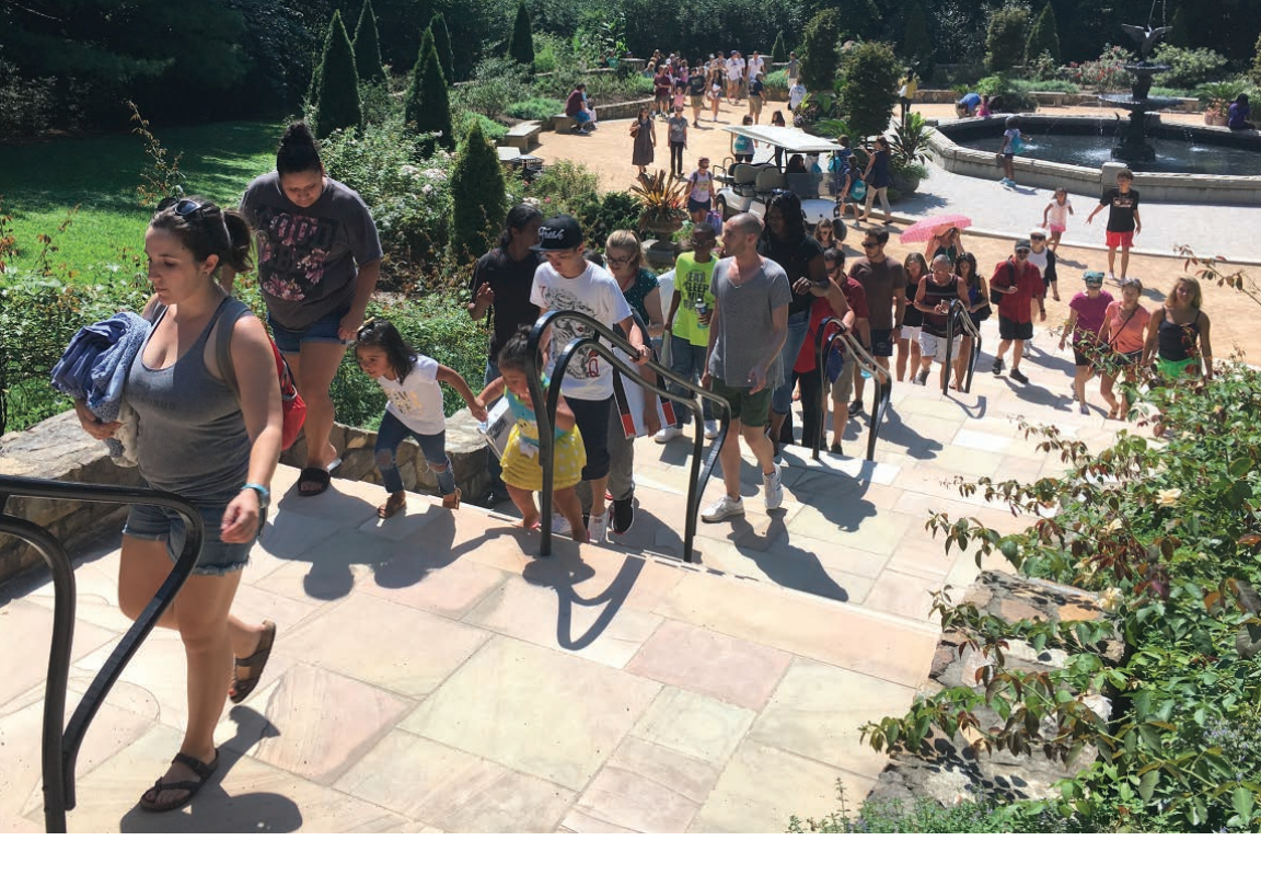
Goal D: Foster a safe, accessible and inclusive Gardens experience