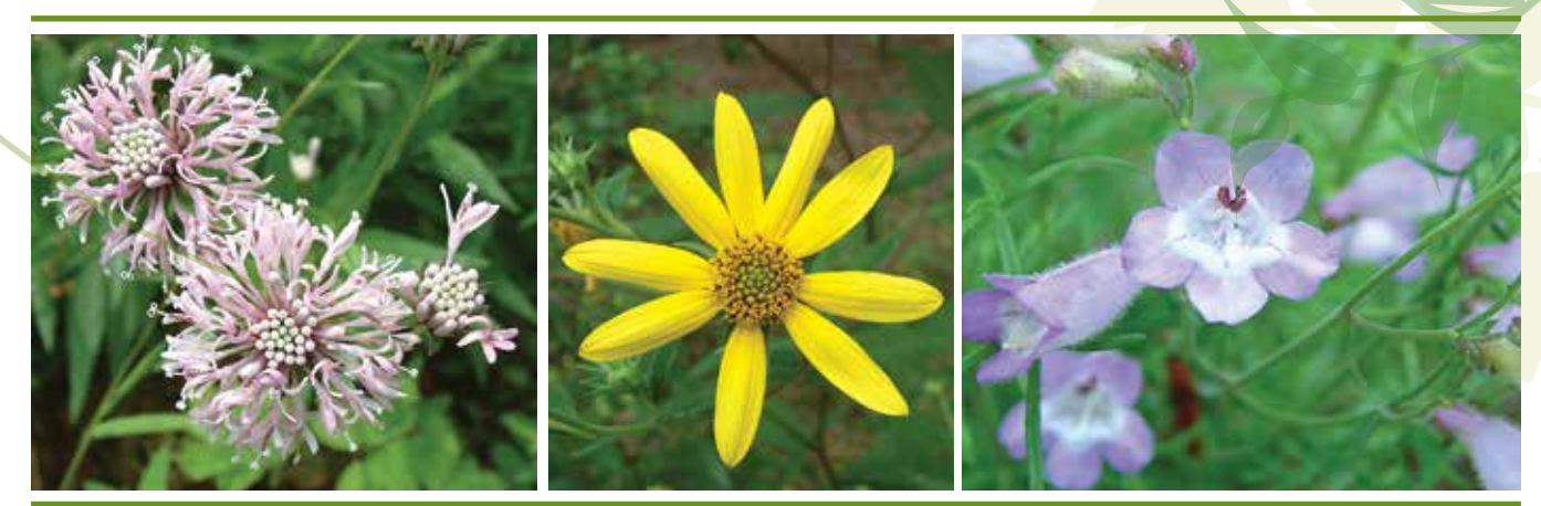
Among the plants in the Steve Church Endangered Species Garden are, from left: Mohr's Barbara button ( Marshallia mohrii ); Schweinitz's sunflower ( Helianthus schweinitzii ); and Georgia beardtongue ( Penstemon dissectus ). Facing page: the new millstone boardwalk.