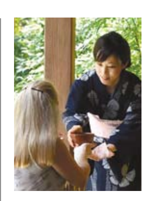
Clockwise from top left: Duke Law students volunteer in the nursery; visitors enjoy a walking tour; volunteer docent training; a Japanese Tea Gathering.

We also began planning for a grand celebration of the Volunteer Program's 25th anniversary in 2016—we look forward to toasting the volunteers' many important contributions to the Gardens' growth.