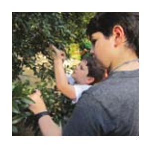
Above: Children learn about nature in the Gardens' Children & Family Programs.

Nature Adventures Camp and our other discovery programs for children continue to draw a strong following of youngsters curious about how the Earth's plants and creatures live and grow. Our camp educators help children make critical connections between themselves and the world outside their doors.